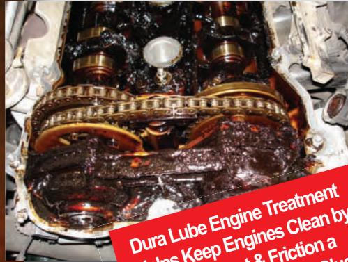
Untreated Engine with Sludge Buildup

Dura Lube Engine Treatment Helps Keep Engines Clean by Reducing Heat & Friction a Major Cause of Engine Sludge